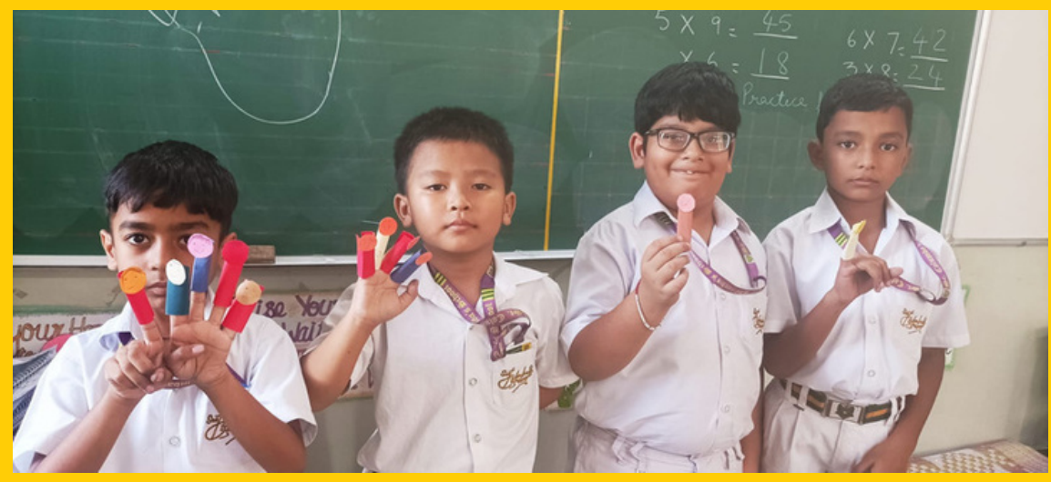
SDG 5 Gender Equality Activity- Class 2

In Class 2E, students made creative Finger Puppets of their family members during their EVS class. They spoke about each family member and highlighted the significance of each individual within the family. It was emphasized that each member is important and equal, regardless of gender.